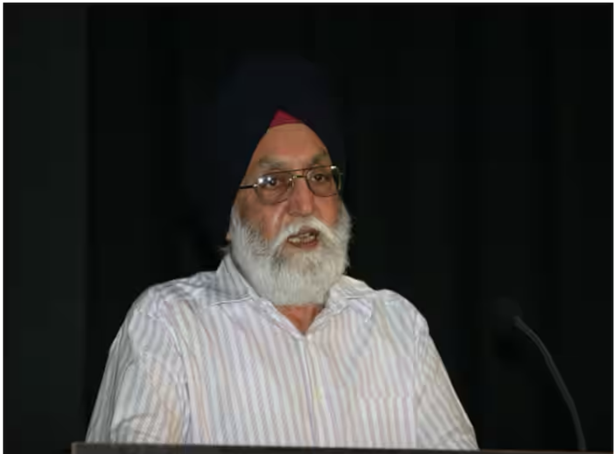
Former Chief Election Commissioner and Union Minister of State Manohar Singh Gill

By: ABP News Bureau | Updated at : 15 Oct 2023 09:29 PM (IST)