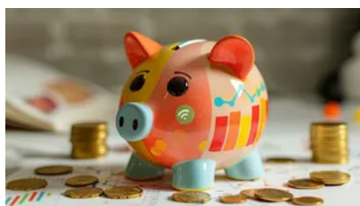
NPS Vatsalya Scheme: How To Apply, Eligibility, Tax Benefits For New Pension Scheme For Minor Children

recognition and its members were invited to provide expertise and technical assistance to countries such as Nigeria, Indonesia, Cambodia, South Africa, amongst others.