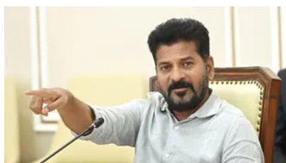
Telangana To Boycott NITI Aayog Meeting

His great work for the nation in various fields brought him the honour of Padma Vibhushan and Dadabhai Naoroji New Millennium International Award.