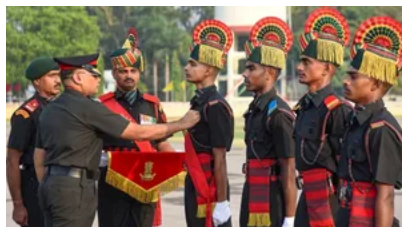
10% Reservation For Ex-Agniveers In CAPFs, Assam Rifles: Govt