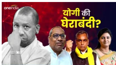
Rising Tensions Within Uttar Pradesh BJP Government After Lok Sabha Elections