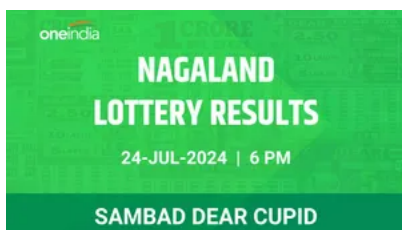
Nagaland Sambad Lottery Dear Cupid Wednesday Winners July 24 At 6 PM - Full Results